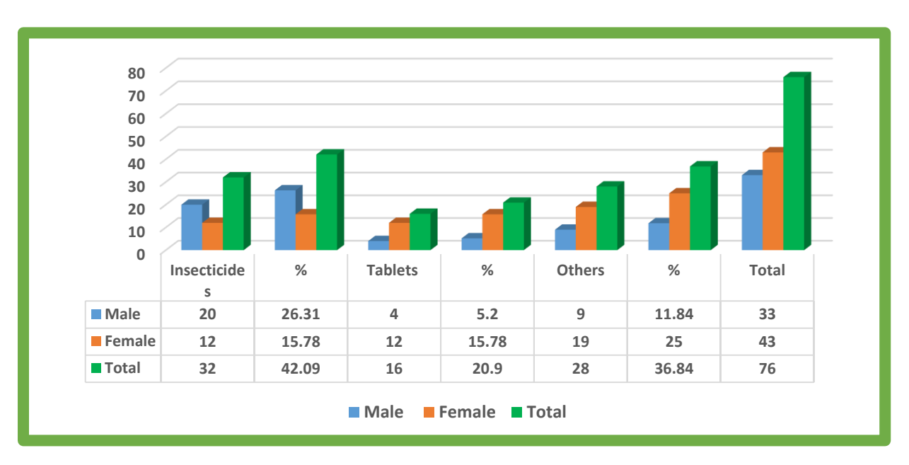
Graph#3 Gender Distribution and Type of Poison taken by Victim