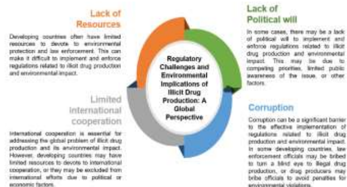
Figure 2. Regulatory Challenges and Environmental Implications of Illicit Drug Production: A Global Perspective. The above figure shows that the lack of resources in developing nations makes it difficult to implement regulations that regulate illicit drugs that have adverse impacts on the environment. The production of illicit drugs is hampered by a lack of political will. The primary responsibility of political institutions is to provide basic information about illicit drugs to the general public. To address the global problem of illicit drugs, there must be limited international cooperation. However, the resources available to developing countries to participate in international cooperation are limited, or they may be excluded for political or economic reasons. Many factors hamper the effective implementation of illicit drug regulations, but corruption is one of the most significant.

Environmental rights are adversely affected by two primary factors. First, high deforestation resulting from illicit crop cultivation has led to water source contamination due to the use of cocaine base paste and cocaine hydrochloride production processes. Second, the use of glyphosate for crop eradication has serious health consequences, including an increased risk of cancer (e.g., four types: lung, liver, kidney, pancreas, and lymphoma), chronic reproductive effects and fetal and neurological malformations such as Parkinson's disease [32]. In conclusion, addressing the challenges associated with the implementation of regulations concerning drug production and its environmental impact in developing countries requires a coordinated approach involving governments, international organizations, and civil society. This approach should focus on capacity building, promoting transparency and accountability, and fostering international cooperation.